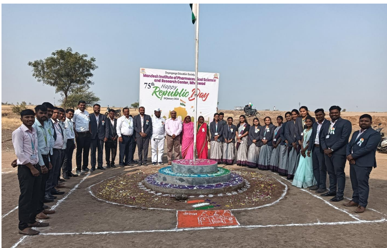
Group photo teaching and non-teaching staff members with guests and management members