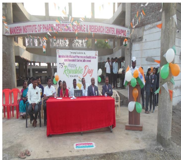
Founder secretary addressing the audience