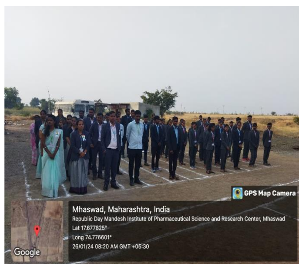
Participated students and teaching, non-teaching staff members